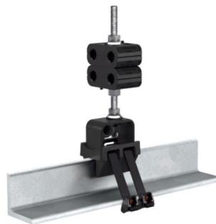
Universal Base with Threaded Rod Adapter 900712-10